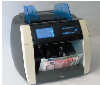
The design of BellCount V510 is innovative and compact with an integrated carrying handle.