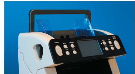
Integrated carrying handle.